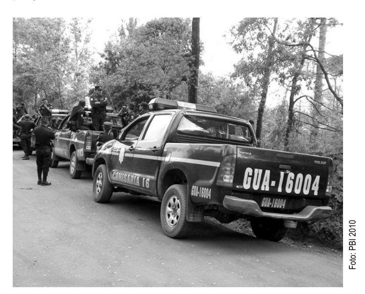
PNC officers near the Las Trojes I community during 2010.

These statements, and current events, confirm that the government considers the state of prevention to be an effective or viable mechanism for tackling violence. In its first two years of power, it has used the resource on five occasions in different parts of the country.<sup>14</sup> The first state of prevention was declared in Guatemala City on 7 May 2008 to control striking truck drivers who had blocked the main routes into the capital. The second was in Coatepeque on 6 June 2008, following disturbances connected with the forcible removal of street vendors. Later, in San Juan Sacatepéquez, a state of prevention was declared between June and July 2008 in response to a conflict between local communities and the company Cementos Progreso. On 24 April 2009, conflicts about waste disposal resulted in the declaration of a state of prevention in Huehuetenango. Finally, a state of prevention was declared in 2009 in the department of San Marcos due to conflict in the context of social demands for the nationalisation of electric energy and tensions between communities and the company DEOCSA, the Guatemalan subsidiary of the transnational company Union FENOSA. On at least four of these five occasions,