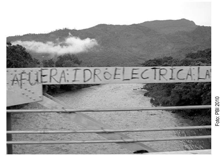
Grafitti against the hydroelectric plant painted on Jupilingo Bridge, Chiquimula

As long as there are no community consultations carried out in Chiquimula, the opinion of the Chortí people will be difficult to measure.