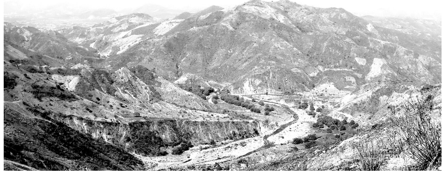
The Rio Grande river, where the El Orégano hydroelectric plant will be built.

years of studies in collaboration with civil society, the municipality, the economic sector and small producers, and has studied 600 sources of water to identify projects that could benefit the region. Although the mancomunidad does not promote the dry canal project, part of the implementation of its projects relies on funds derived from such projects.<sup>21</sup>