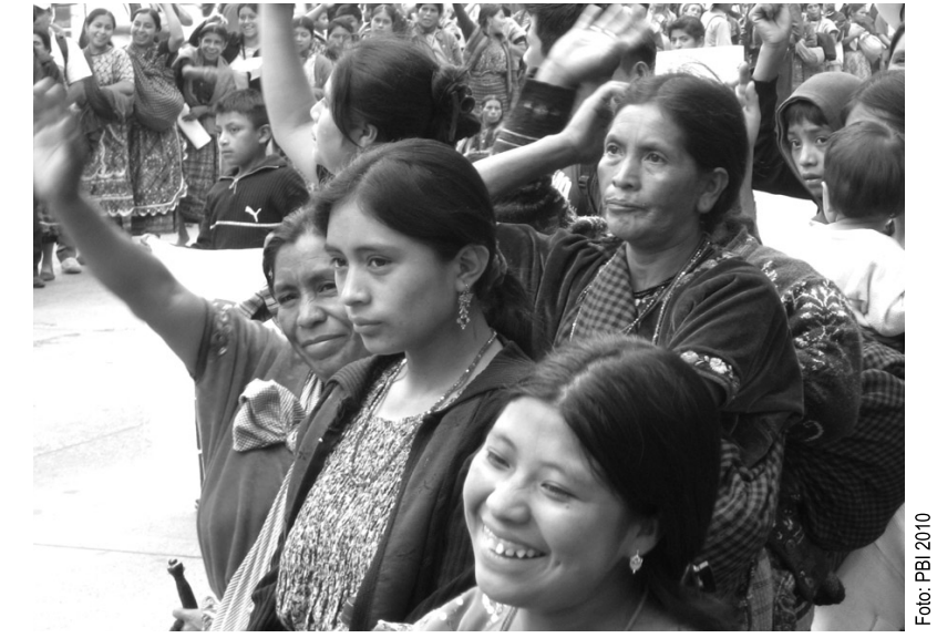
Kaqchiquel women from San Juan Sacatepéquez protest against the exploitation of natural resources during the Earth Day march in Guatemala City, 22 April 2010.

This article attempts to uncover the experience of Guatemalan women who have organised themselves in defence of their land. We will look at the strong bond between these women and Mother Earth and her natural resources, and at the impact that the extraction of these resources has on their lives. We will also look at the data relating to violence against women in Guatemala, gathered by national institutions and international organisations, which show women in a