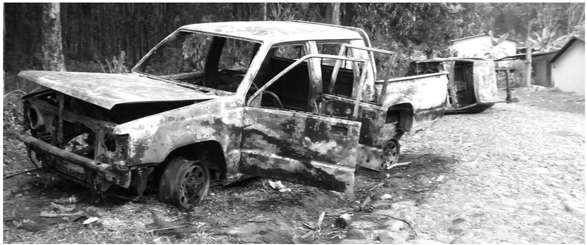
Burnt out vehicles in the village of Las Brisas, San Marcos, during violence following the disconnection of the electricity supply in March 2010.