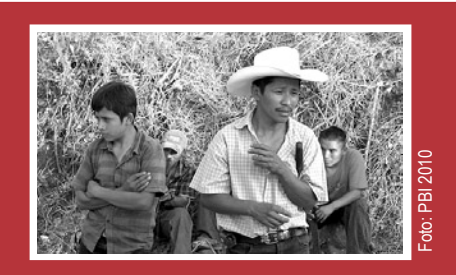
Major development projects in Chiquimula Pages. 5 - 8