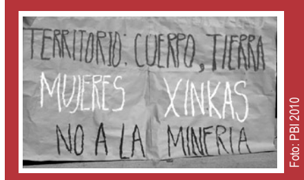
Women, land and territory Pages. 2 - 4