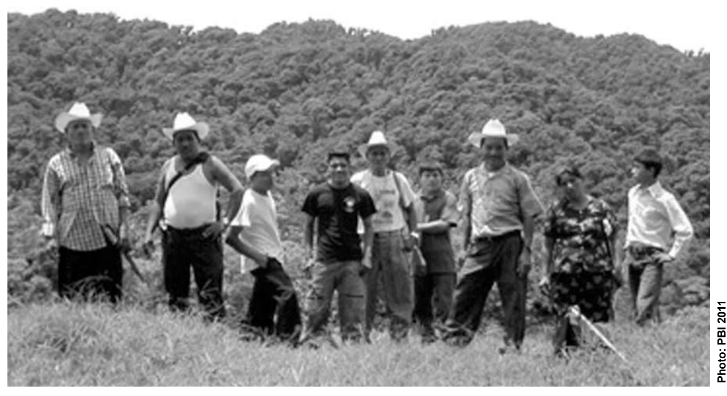
APMG members in Las Granadillas mountains, Zacapa, February 2011

"In the first place one of the major limitations of the Association (APMG) have been financial issues. To complete the technical study required to declare a protected area is very costly. In fact, the process of undertaking the study was started 10 years ago, but it has not found support. Since then it has been carried out in whatever way possible." Secondly, "there has been a lot of disinformation (...) There is a group dedicated to disinformation, stating that if the mountain is declared protected the people living there are going to lose their land and this scares people. They are groups with particular interests and including private property owners."17