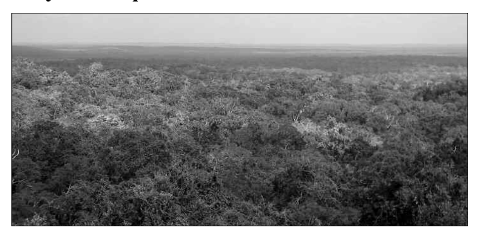
Panoramic view of the Mayan Biosphere Reserve.

In 1995, further steps were taken to confront the serious problem of deforestation and the pillaging of the nation's cultural heritage in the Reserve. To counter this alarming trend, CONAP granted concessions to communities located within the Reserve. Many concessions had already been granted prior to the creation of the