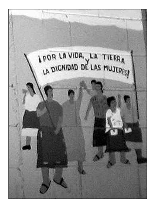
Mural of the organization Ixmucané.

There are also two Mayan groups pertaining to El Petén: the Itzas, living primarily in the town of San José with a population in 2002 of 1,983, and the Mopan, living in San Luis, with a population of 2,891.VII Both make up only a small part of the indigenous population in the department. Among indige-