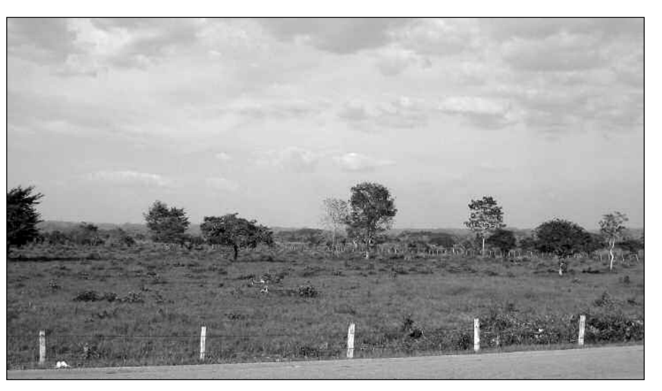
Extensive tracts of land in El Petén are being used for mass cattle raising

and adapting the land suitable for raising cattle, and cultivating African palms and other mass crops," Montero said "These peasants receive a lot of money. but they only know how to work the land, so that if they sell a plot of land, they invade another plot."