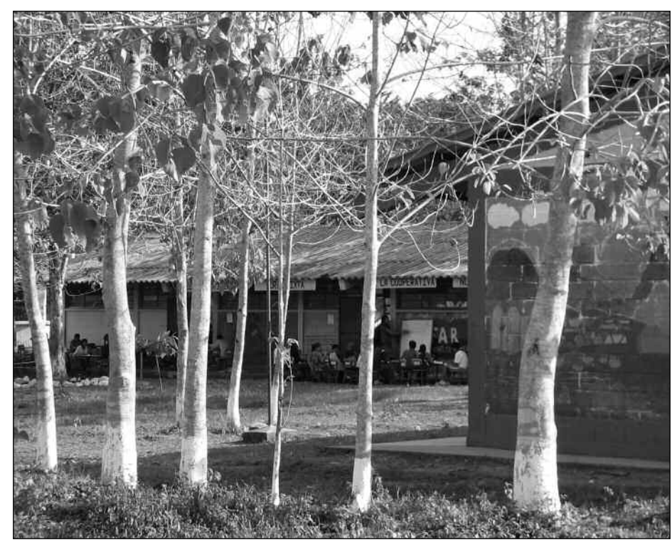
The school at the Nuevo Horizonte cooperative.

Before deciding to operate as a cooperative, we visited all of the cooperatives existing in Guatemala, and none of them satisfied us, and so we designed our cooperative the way we wanted it. We said that we wanted a model cooperative where, first, we show the government that you can accomplish things with the political will, and we are going to do the things that the government promised to do but didn't do. First, we decided what we wanted to be, because the cooperative was going to be created with these characteristics. Second, we