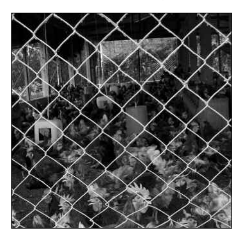
Hen production project at the cooperative.

We are about 106 families, almost 400 people. There are 107 of us who are the cooperative's partners, the owners of everything the cooperative has. Of the cooperative's four projects, one is reforestation, and other is cattle raising and a political tourism project, which is in its initial phase. We call the tourism political tourism because what we sell is our own history, the history of the formation and emergence of the community. And the other project is food safety. We are trying to conduct fair trade in which this project attempts to eliminate intermediaries. And we are working with the communities to consume what we ourselves produce. Another aspect is to carry out a commercial exchange with other organizations. Another project under development is one of fish breeding.