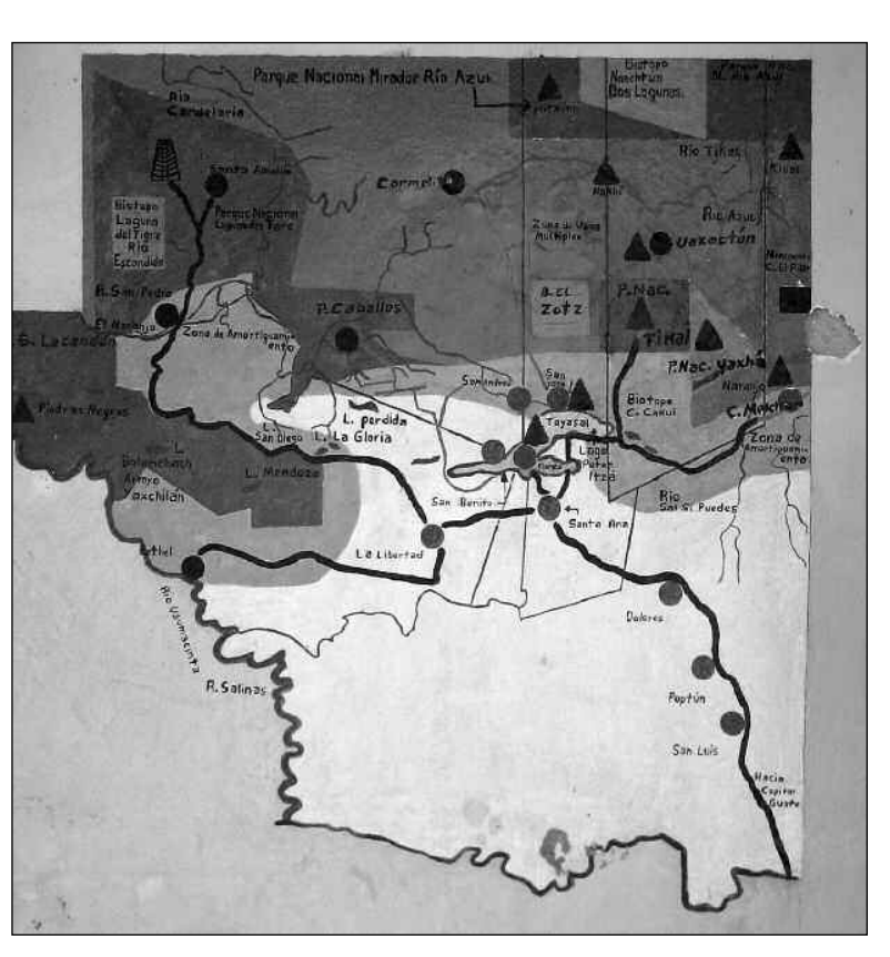
Map of El Petén displayed in the department's government offices in Flores. El Petén.

Created in 1990, the Mayan Biosphere Reserve faces several threats today, including deforestation and forest fires, all of which is affecting the biodiversity of the reserve.