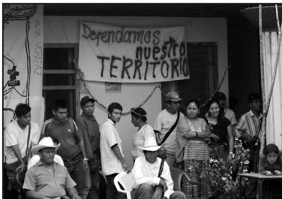
Community referendum on mining in Ixcán, April 2007.

In mid-2000, PBI began receiving a number of requests for international accompaniment. As a result, an investigation was carried out in the field which revealed a deterioration and in some cases a closing of the space for human rights defenders. In April of 2002 PBI decided to reopen the Guatemala Project to carry out international accompaniment and observation in coordination with other international accompaniment NGOs. The new PBI office was opened in April 2003.