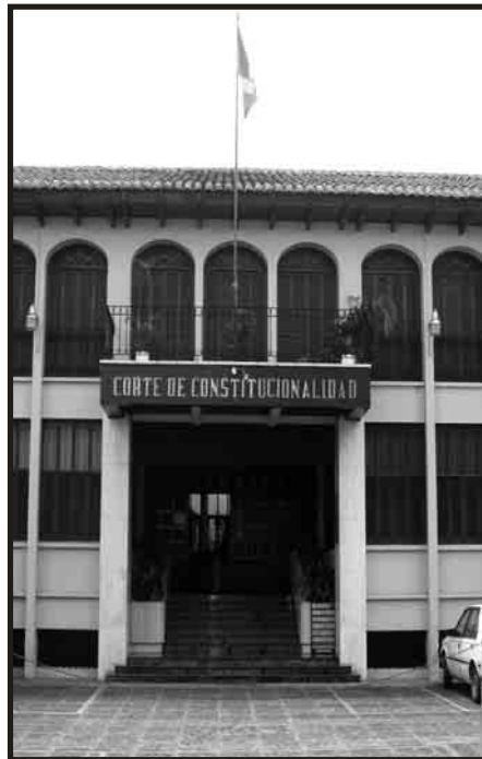
Constitutional Court of the Republic of Guatemala.

Nations for the establishment of a Commission to Investigate Illegal Bodies and Clandestine Security Apparatus (CICIACS). However, the Commission was rejected by the Guatemalan Congress because it violated Guatemalan sovereignty. The Constitutional Court (CC) declared it unconstitutional 2 . Confronted by this serious setback, the Guatemalan organizations of the Coalition for CICIACS said that the decision "rejected the possibility of combating the clandestine apparatus and citizen insecurity". It was a lost opportunity, as the Agreement itself proposed to help the Guatemalan State to investigate the structure and activities of the illegal bodies and clandestine security apparatus and their links with the State, and with organized crime, as well as to prosecute the people responsible for the form and operation of these entities 3 .