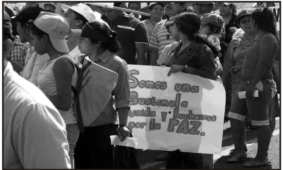
Workers' Day march, 1st May 2007.