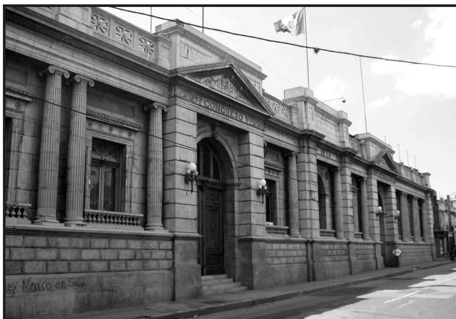
Congress of the Republic of Guatemala.