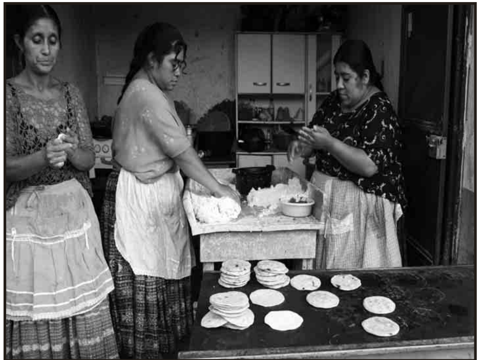
Women making tortillas, Santa Cruz, Alta Verapaz.

According to the Food and Agriculture Organization of the United Nations (FAO), the production of maize-based ethanol in the US has quadrupled since the year 2000. The growing demand, primarily on the part of the US and China, is affecting the maize market, which has seen a sharp rise in prices at an international level. As reported by Inforpress Centroamericana, Guatemala has experienced an increase in prices of up to 78% in the first months of this year, which has affected both consumption and distribution 2 . Within the commercial panorama of Central America, biofuel is seen as an opportunity to participate in the world market, and increase both employment and profit. The World Development Bank wants to support projects initiated by the