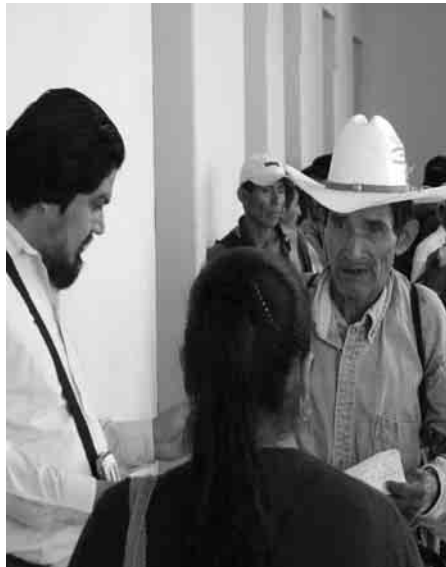
A rural worker speaks with members of the Union of Campesino Organisations of the Verapaces (UVOC).

The Union of Campesino Organisations of the Verapaces (UVOC) states that the source of a large number of conflicts in Guatemala is, for the most part, the incongruity of two opposing claims or rights to land. One is