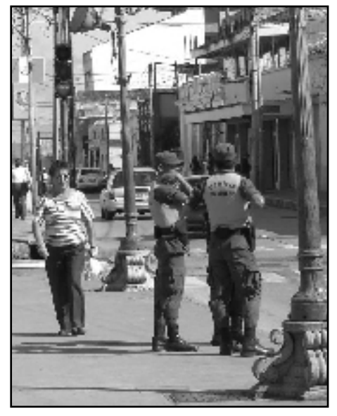
Soldiers patrolling the 7th Avenue, Guatemala City, 2006.

Ten years after signing the Peace Agreements, civilian power has not been strengthened integrally. At the moment, for example, the weaknesses of the police, an institution created in the Agreements, reflect this situation. In its report Security and Justice in