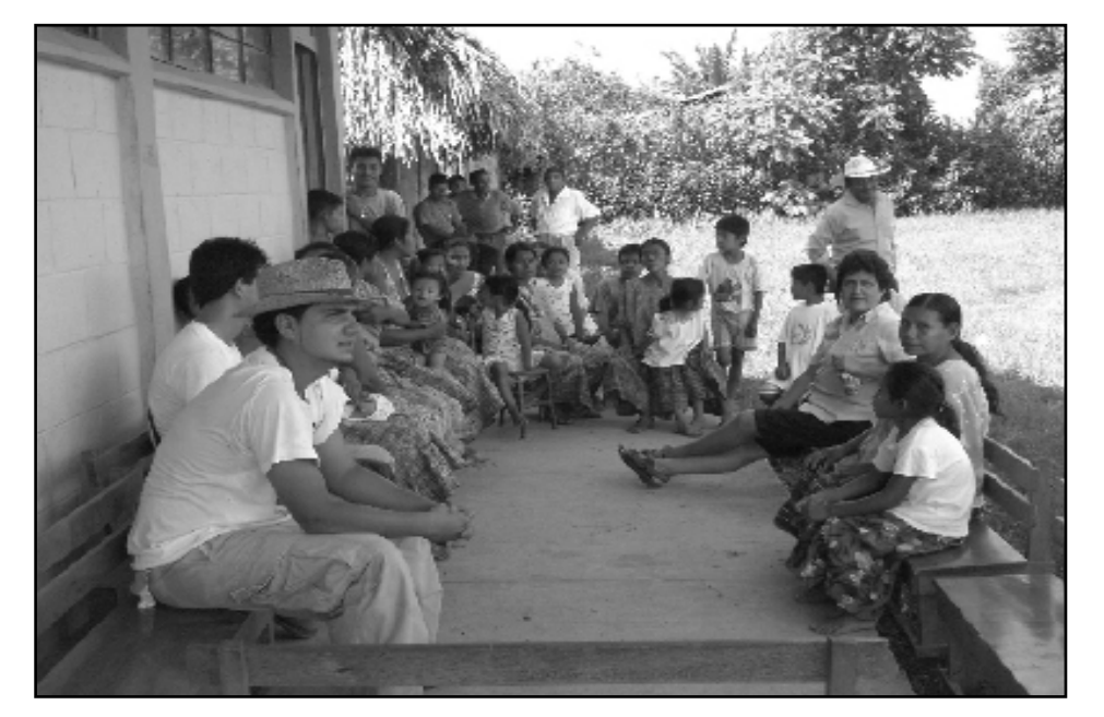
ASALI during an awareness workshop in the community of Polígono.

the Project Coordination Office who are continue "opening spaces for peace".