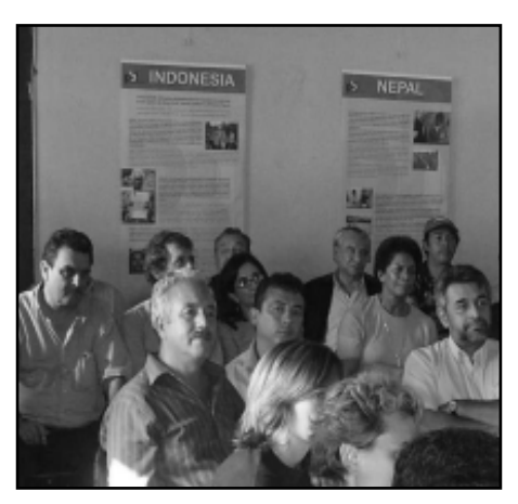
25th aniversary celebration.

of union members, PBI supporters and members of PBI. The objectives of the visit were to: a) strengthen the solidarity for Guatemala and the Support Network; b) increase awareness regarding the present situation in Guatemala and the connections that exist with Canada - especially regarding Canadian social movements and investments and; c) to learn about the PBI in Guatemala and the reality lived by human rights defenders in the country. The delegates had the opportunity to meet with organisations that we accompany, other civil society representatives, and visit Lake Izabal.