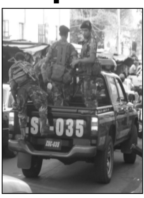
Soldiers getting on a National Civil Police unit in Escuintla, 2006.