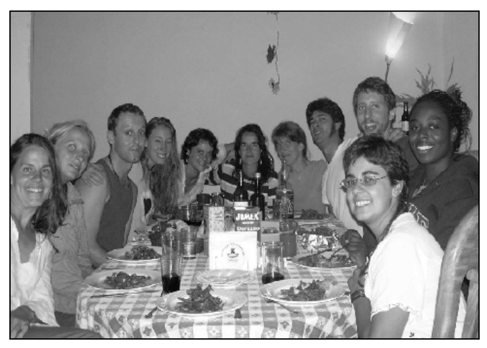
The whole Guatemala team celebrating the arrival of the 2 new members.

In mid-2000, PBI began receiving a number of requests for international accompaniment. As a result, an investigation was carried out in the field which revealed a deterioration and in some cases a closing of the space for human rights defenders. In April of 2002 PBI decided to reopen the Guatemala Project to carry out international accompaniment and observation in coordination with other international accompaniment NGOs. The new PBI office was opened in April 2003.