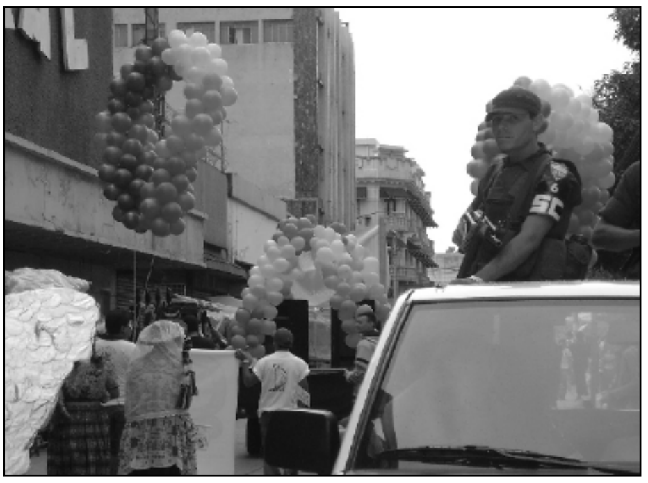
Combined forces patrols during the Gay Pride March, June 2006.

Since April this year the army has returned to being part of the daily scenario on the streets of Guatemala City and in the departments, with significantly high delinquency rates in the country. 2,400 soldiers have been turned over to the auspices of the National Civil Police (PNC) to participate in combined patrol forces in order to strengthen public security and confront the general insecurity<sup>1</sup>. Five months since the advent of the combined patrol forces, the violence rates have not decreased. Nevertheless, the President of the Republic, Oscar Berger, announced that they would continue with the action and anticipated that 1,200 soldiers will be absorbed by the PNC. In the same way, the Minister of Defence. Francisco Bermúdez. said that the measure should be extended for at least "two presidential periods" 2.