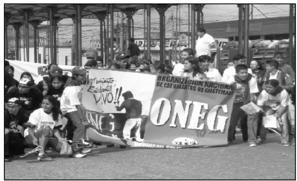
Students in the demonstration on the 20th of October, Day of the Revolution.

demanded that order be maintained. This meant not only forced military the National Central Institute for Boys' Secondary Education, the National the National Central School for Boys<sup>4</sup>. The youth movement of this period