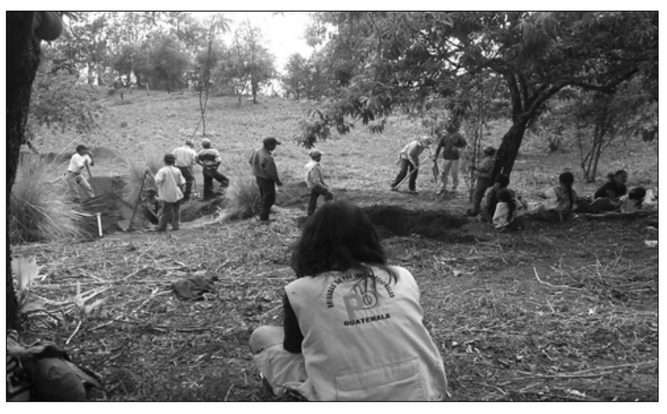
PBI accompanying CONAVIGUA during an exhumation in Buena Vista, Sacapulas.

On the 5<sup>th</sup> April, it was announced that on the previous day, the Court of Constitutionality (CC) had judged valid the community consultations that were carried out in Río Hondo, Zacapa, and in Sipakapa, San Marcos, in June 2005, concerning the presence of a hydroelectric power station and the mining industry in the respective areas. The result of the consultations showed the discontent of the population with the presence of hydroelectric and mining activity in their territory. The consultations were strongly supported by the Madre Selva Collective and were observed by,