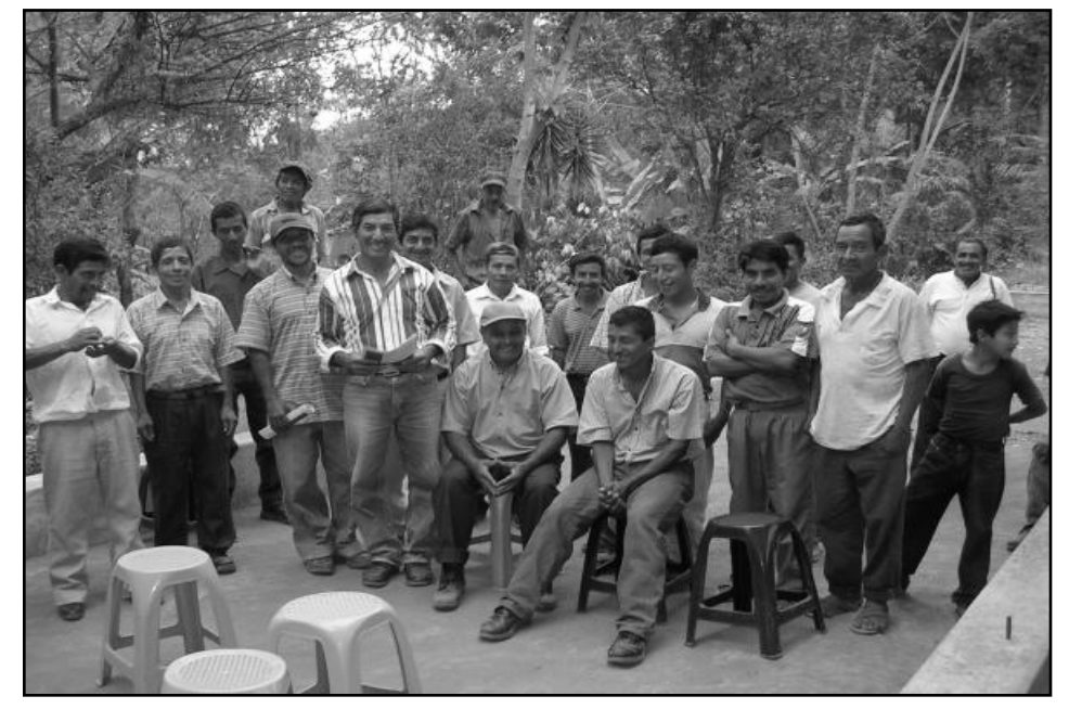
Campesinos fired from the San Jerónimo and La Fábrica estates in San Marcos.

of private property. On the contrary, one of the campesinos leaders of the Las Delicias Estate in San Marcos argues that, "they say we are invading but I say we are not invading, we have a right to be here. The invaders are you people who have come; you are invaders, because who knows where you came from. We are not invading because we were born here and live here, already we have grown old here and we will die here... we have every right to this land." <sup>14</sup>