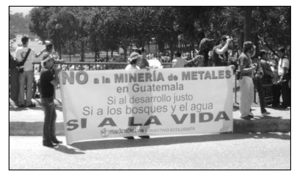
Participation of Madre Selva in a protest in the in the capital.

15 Joint declaration of the Movement for the Defence of Water, Mexico City, 10 March 2006. 16 Interview with Pablo Sigüenza, 13 April 2006. 17 Latin American Water Court. Expansion of Concessions and Mining Activity in Central American Territories. March 2006. 18 La Prensa Libre, 25 March 2006. 19 3rd Meeting of the Latin American Network against Dams and Rivers; Guatemala, October 2005.