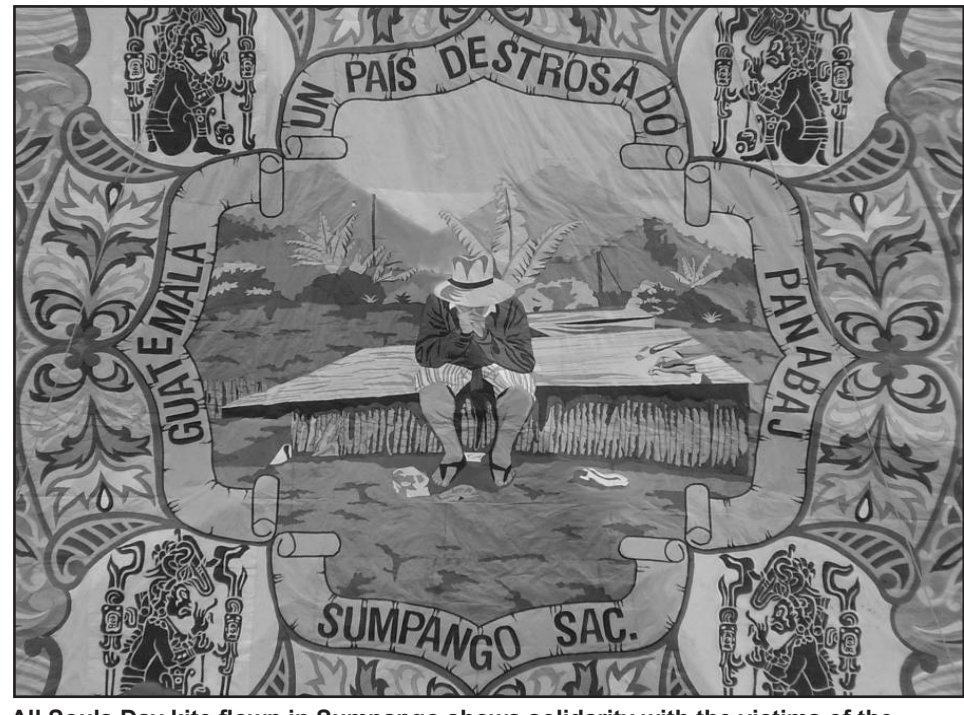
All Souls Day kite flown in Sumpango shows solidarity with the victims of the mudslide in Panabaj.