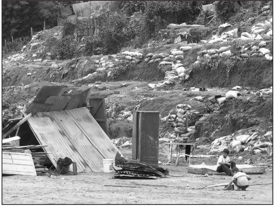
The day after the eviction the community of Getzemani salvage what they can from the rubble of their homes.

"The government can say that it has got everything under control but anyone who has to live with this situation every day realises that it's all a lie, nothing has improved".