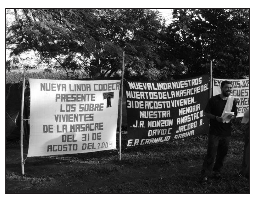
Banners at the commemoration of the first anniversary of the eviction at the Nueva Linda estate.

On the 13th of October 2003, around 100 campesinos of Monte Cristo and other rural communities occupied parts of the Nueva Linda estate in order to pressure the authorities of the Ministry of Justice and the National Civil Police (PNC) into carrying out investigations. Since the start of the occupation, they have received broad support from the entire campesino sector; in addition the protestors garnered a lot of direct help from other rural workers, which resulted in a swelling of the number of people occupying the estate to 600 by the end of the year.<sup>3</sup>