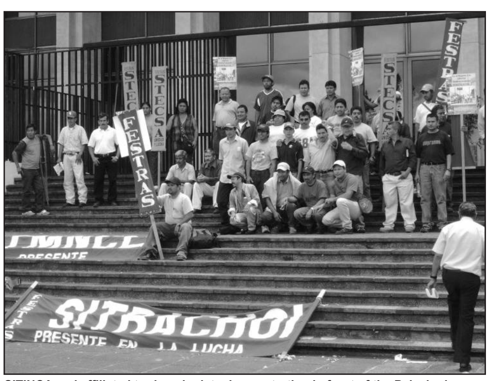
SITINCA and affiliated trade unionists demonstrating in front of the Palacio de Justicia.

The Salvadoran company maintains three distributors in Guatemala, in Quetzaltenango, Chiquimula and Guatemala City. On the 10th of August 2005, without previous warning, the distributor in Mixco, Guatemala City, was closed. This was the only one of the three to be unionised. The company argued that the closing was due to a fine which they were