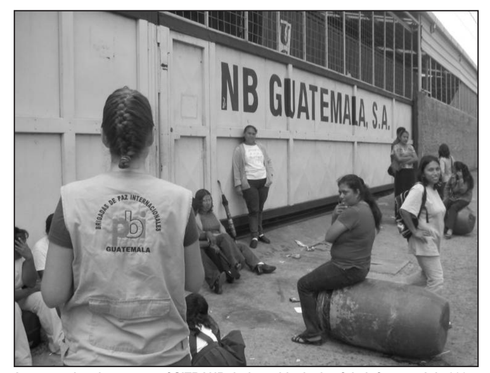
Acompanying the women of SITRANB during a blockade of their factory, July 2005.

In Guatemala, the Coffee Industry Company is the proprietor of the Northern and Southern Coca-Cola plants as well as of an instant coffee factory in the capital. The International Union of Food,