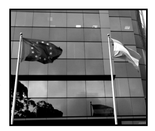
Flags flying outside the offices of the European Union Delegation to Guatemala.

The Copenhagen Initiative for Central America and Mexico (CIFCA), together with Grupo Sur, organized a conference on the 3rd and 4th of May 2006 in Brussels in order to unite the will of both regions to insist that an alternative model of Association Agreement, based in the principle of non-reciprocity and special and differentiated treatment, is not only possible but necessary. For CIFCA, a social dimension to Central American integration is essential if a progressive cohesion is to be achieved, resulting from substantial improvements in the distribution of wealth and income and the elimination of gender, racial and ethnic discrimination. CIFCA insists in the urgency of realizing this social dimension through targeted regional policies that compliment