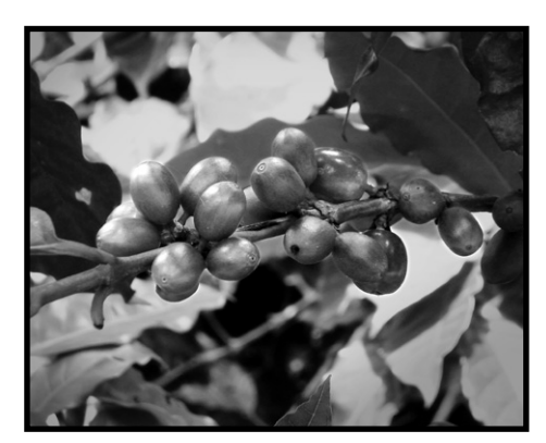
Coffee maturing on the branch.

It's the text that says: "I was hungry and you gave me nothing to eat, I needed clothes and you did not clothe me, I was in prison and you did not visit me, I was sick and you didn't take care of me..."