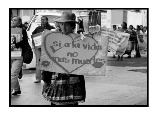
Demonstration on 26 November 2007, for International Day of No Violence against Women, Guatemala City.

Guatemala occupies 98th place in the Women's Development Index, an indicator that illustrates the obstacles