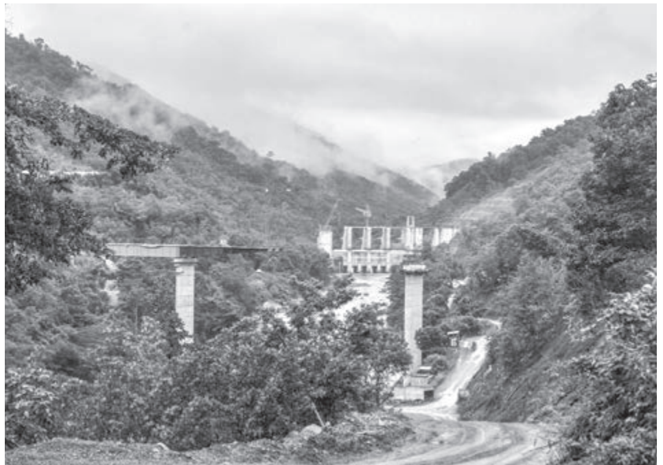
Panoramic view of Oxec hydroelectric dam. Guatemala, May 12, 2017.

PBI was present at the community consultation on August 27. This was the start of our accompaniment to the Peaceful Resistance of Cahabón.